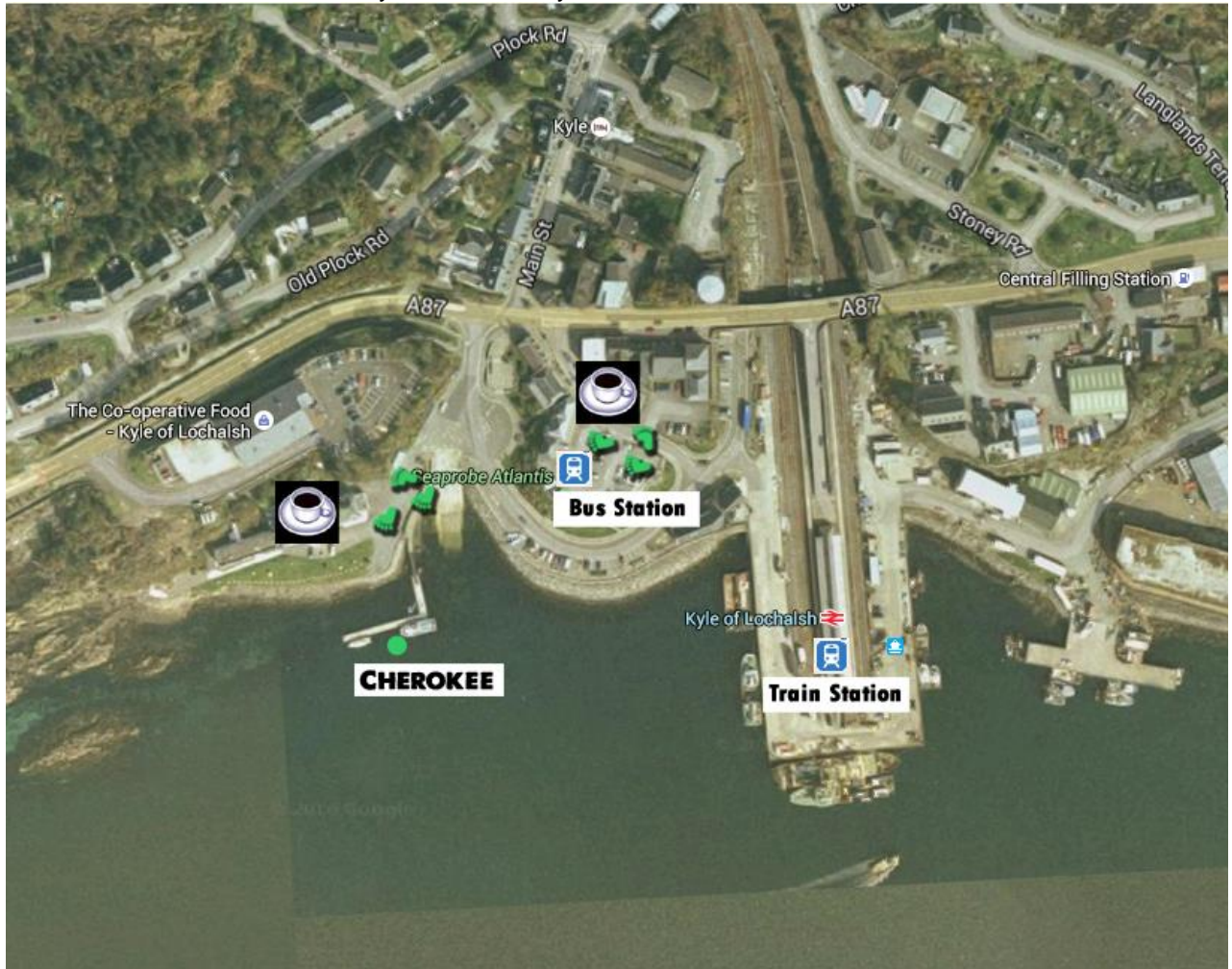
Kyle of Lochalsh

From the train or bus station in Kyle of Lochalsh you can walk to the boat within 5 minutes.